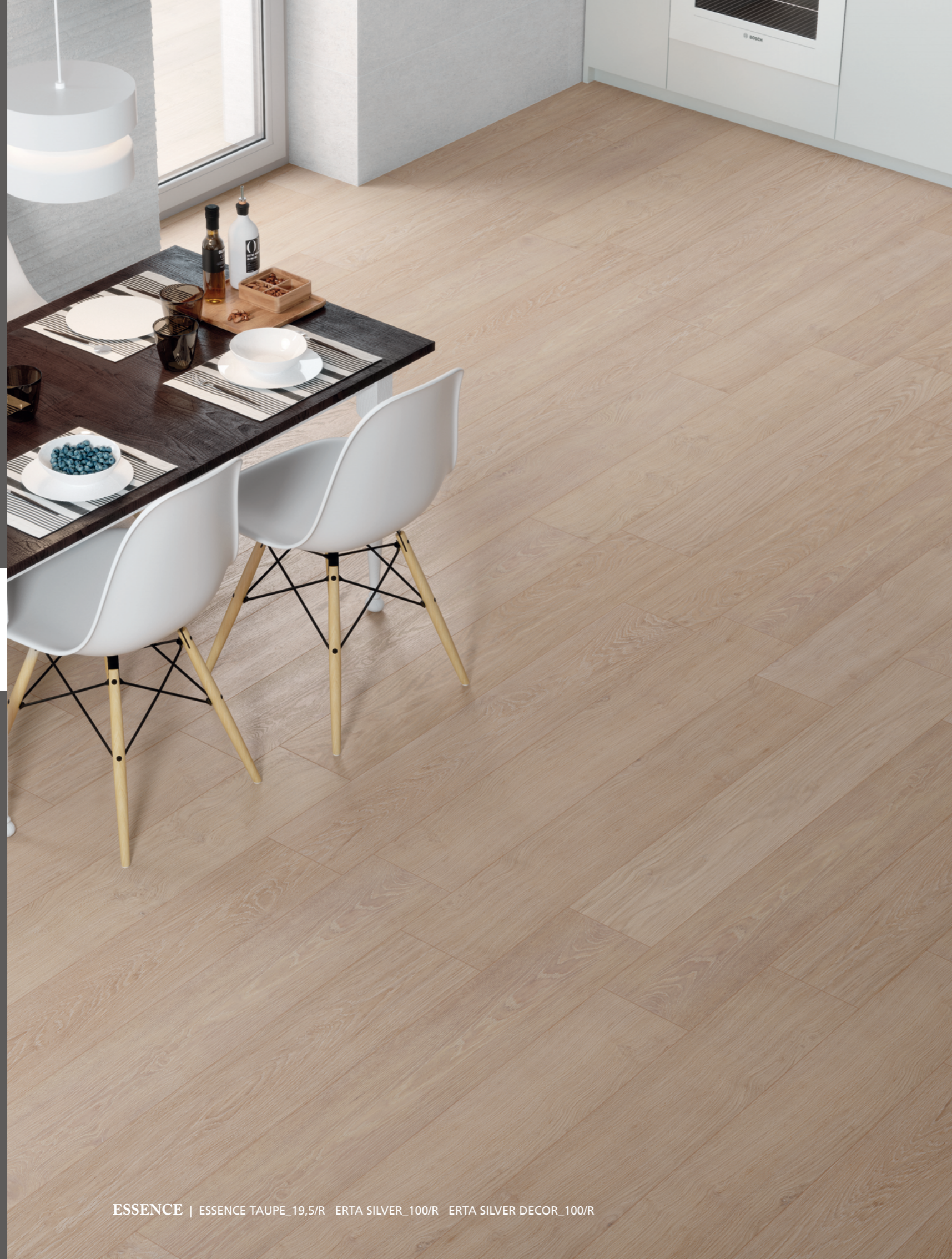
ESSENCE | ESSENCE TAUPE_19,5/R ERTA SILVER_100/R ERTA SILVER DECOR_100/R