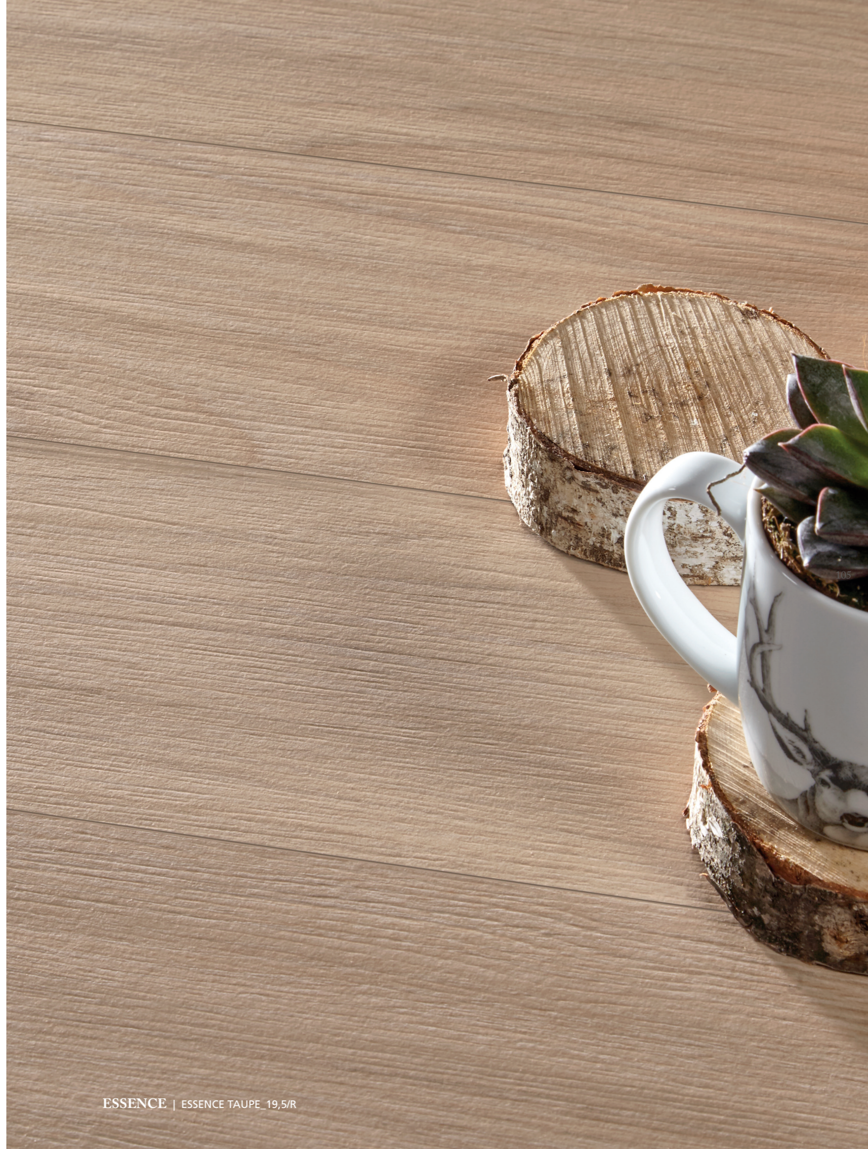
ESSENCE | ESSENCE TAUPE_19,5/R